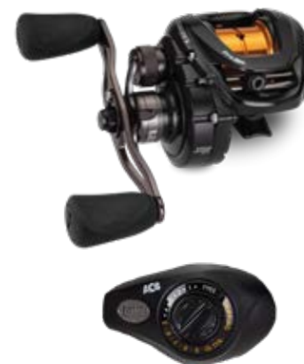
SKIPPING ZONE FOR EASY SETUP