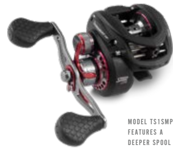
MODEL TS1SMP FEATURES A DEEPER SPOOL